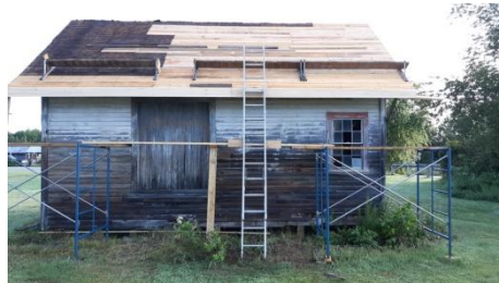
New roof boards installed