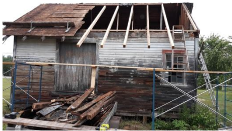
New roof rafters in place in place